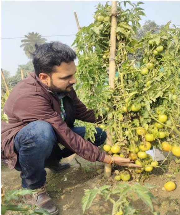
Fig. 1 Fruit Per Plant