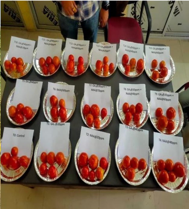
Fig.2 Production Scenario