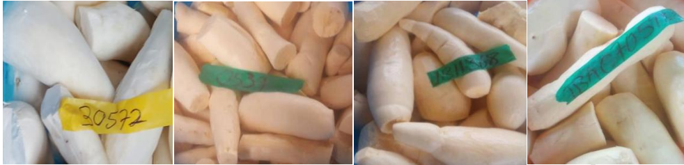
Plate 1. Fresh storage roots of white root (TMSI30572) and three bio-fortified yellow root (TMSI010539, TMSI011368 and TMSI010593) cassava varieties (from left to right)