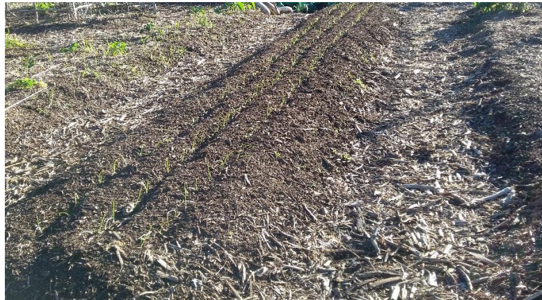
Figure 2. Organic mulch (wood chips) used in the community garden

Mulching is the main weed management tactics used in the garden for suppressing weed. Organic mulch such as wood chips, pine and spruce bark is commonly used in the garden (Figure 2). It is applied at a thickness of 4-5 inches between the beds and walkways. It was observed that the area covered by thick mulch is free from weeds while the uncovered area is continually getting weeds. That's why they tried to get the garden covered all the time. But the garden beds are not covered by mulch because most of the time a small worm named 'Spill bugs' remain in the bark. They can go up to the bed and can cut the seedlings. However, the decomposed mulches are mixed thoroughly with the soil during bed preparation. Mulches control weeds by preventing sunlight from reaching the soil surface that is needed for weed seed germination. The respondent said that mulching practices also improve soil health by retaining the soil moisture and welcoming some beneficial creatures i.e earthworms.