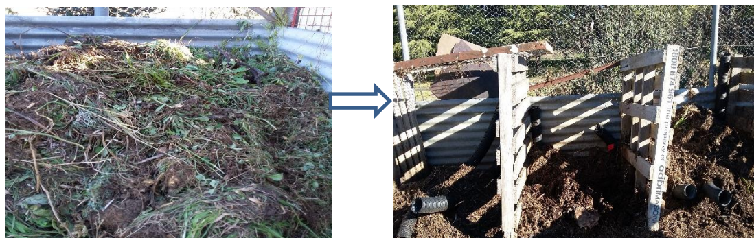
Figure 4. Selected weeds are used for compost production

Tillage during fallow and before sowing or planting is also an effective way to control the weeds. Before crop bed preparation, a deep ploughing is done to uproot the existing weeds from the soil (Figure 3b). Then hand picking is performed to keep the soil free from roots, stems, seeds and inert materials. Sometimes, tillage carried out immediately after harvesting to incorporate the plant residues to the soil. During the cropping phase, light tillage is also performed in between the crop rows. Spades, shovels, garden rakes, garden forks, mattocks and trowels were usually used for tilling. After tillage, the weeds as well as the green parts of the plant are used for compost (Figure 4).