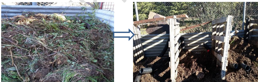
Figure 3. Selected weeds are used for compost production

Tillage during fallow and before sowing or planting is also an effective way to control the weeds. Before crop bed preparation, a deep ploughing is done to uproot the existing weeds from the soil (Figure 2b). Then hand picking is performed to keep the soil free from roots, stems, seeds and inert materials. Sometimes, tillage carried out immediately after harvesting to incorporate the plant residues to the soil. During the cropping phase, light tillage is also performed in between the crop rows. Spades, shovels, garden rakes, garden forks, mattocks and trowels were usually used for tilling. After tillage, the weeds as well as the green parts of the plant used for composting (Figure 3).