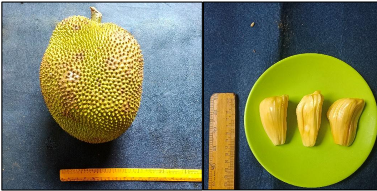
Figure 2: AH 7