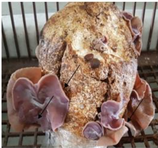
Plate 1a: Matured sporophores from the EW01 grown on sawdust and rice bran.