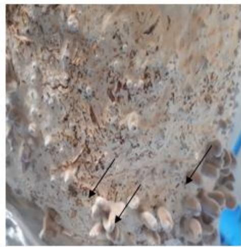
Plate 1b: Matured sporophores from EW1M1.