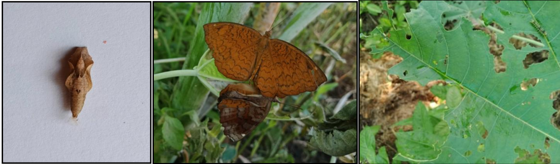
Pupal stage Adult stage Damaged leaf