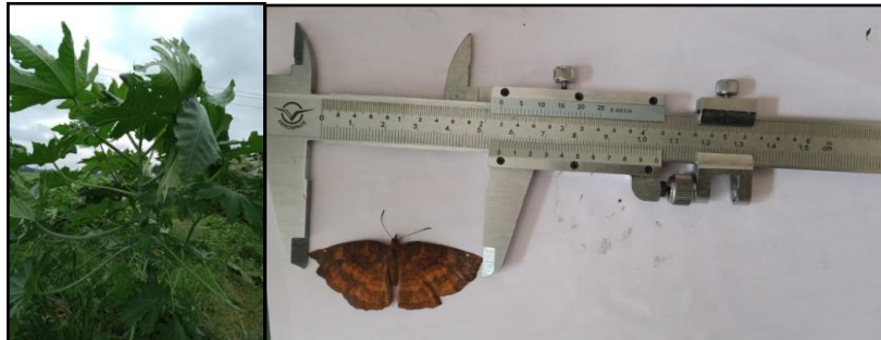
Host Plant Adult measurement