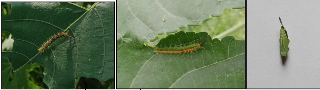
4 th instar larva 5 th instar larva Pre-pupal stage