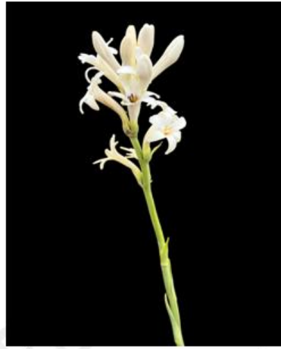
G6- Tenkasi local