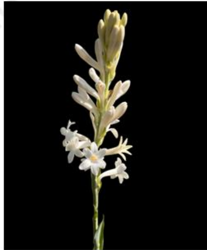
G8- Arka Shringar