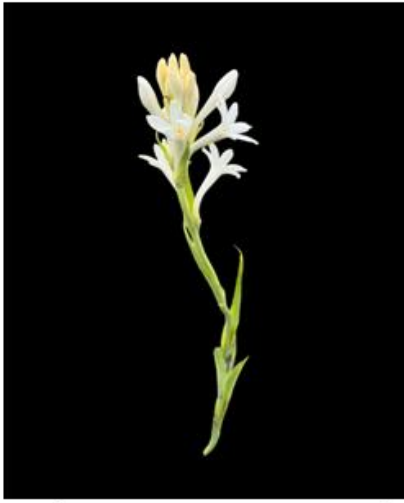
G5- Nilakottai local