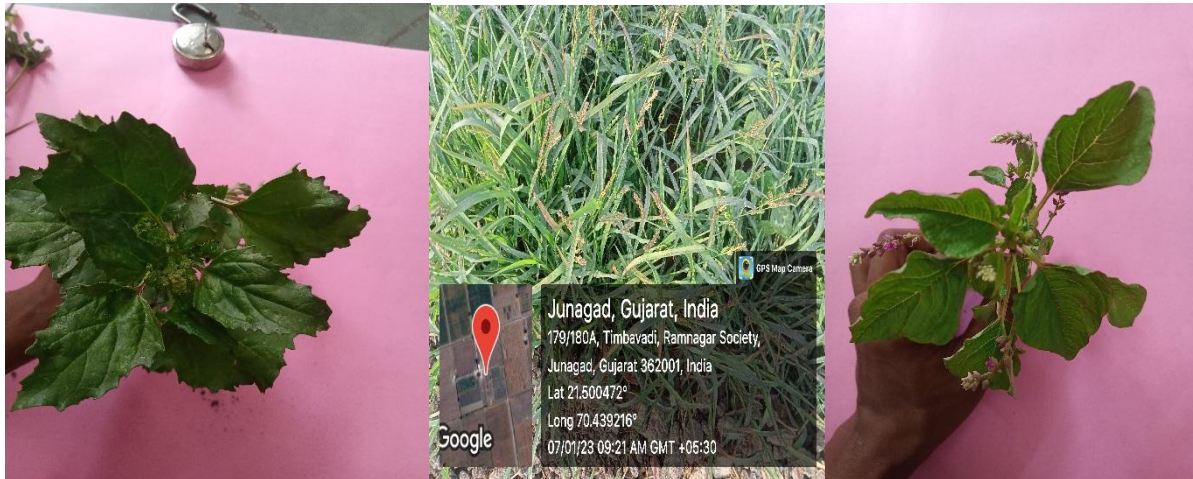
Pic 1. Morphology of plant