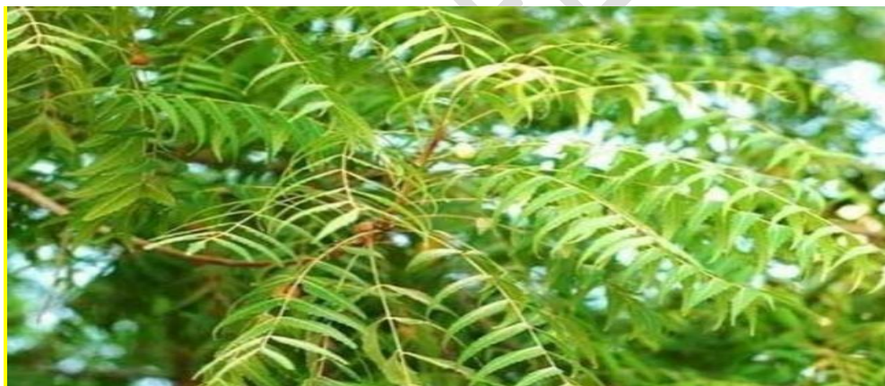
Figure 1: Picture of Azadirachta indica A. Juss Herbarium No: ADAMS, UUH4432 (Eket)

The study was carried out in Akwa Ibom State, Nigeria which lies between latitude 4° 32' and 5° 53' North and longitude 7° 25' and 8° 25' East with total land area of 7.249 km 2 . The leaves of the Azadirachta indica plant (fig.1) were collected from matured plants identified and authenticated in the herbarium unit, Department of Botany and Ecological Studies, University of Uyo. The ethanolic extraction of the leaves was carried out using maceration method (Sujon et al. , 2008). Dogs (puppies) aged about 7 months weighing about 7 – 8 kg were bought from vendors and used for the studies. The crude leaf extract of Azadirachta indica commonly known in the area as neem (Dogoyaro) was screened for anthelmintic effects in vitro using adult worms ( Toxocara canis ) and also in vivo using experimentally infected dogs (puppies infected with Toxocara canis ) according to the modified method of Sujon et al. , (2008).