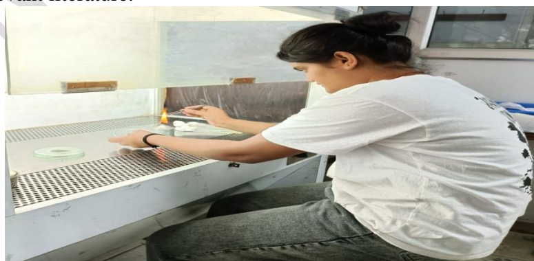
Plate I: Isolation of the pathogen

Leaves were collected from infected chilli plant bearing characteristics symptoms of concentric rings of Alternaria alternata . These leaves symptoms after mounting on solid were examined under microscope to confirm the presence of Alternaria spp. These selected infected leaf parts were cut into small pieces of 2 to 3mm dimension in a manner so that pieces may have some green portion also. Such leaf bits were washed 3 times in sterilized distilled water and then surface sterilized with 0.1% mercuric chloride solution for 30sec. Excess of moisture was removed by putting these pieces in between two folds of sterilized blotting paper under aseptic conditions in the inoculation chamber. Five leaves bits were transferred on PDA medium contained in petri plates aseptically with the help of sterilized forceps. These petri plates were incubated at 25^{\circ}\text{C} \pm 2^{\circ}\text{C} in BOD for 5 to 7 days. After 5 days mycelium growth was observed around leaf bits from this colony growth (Ahmad et al. , 2013), a portion from the periphery having single hyphal tip were separated and transferred to other petri plates having medium to get pure culture and identification of the pathogen was confirmed by observing the morphological feature of colony, spore characteristic and referring the relevant literature.