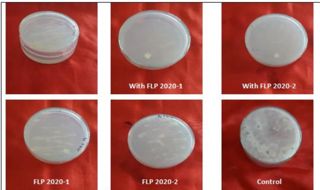
Fig 2: In vitro antagonistic potential of Fluorescent Pseudomonads isolates against Sclerotinia sclerotiorum of brinjal under Inverted plate technique