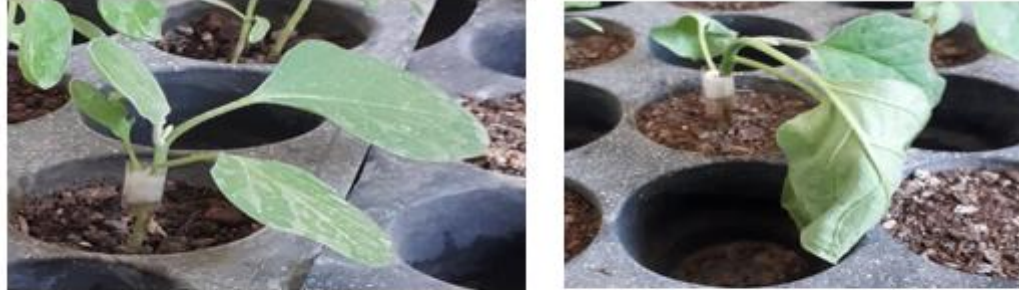
Fig 3: Healthy and SCL infected plant under challenge inoculation conditions