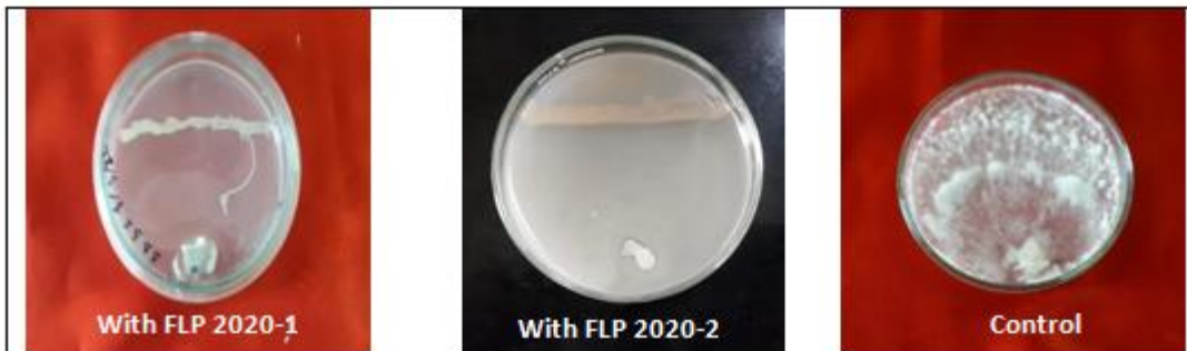
Fig 1: In vitro antagonistic potential of Fluorescent Pseudomonads isolates against Sclerotinia sclerotiorum of brinjal under dual culture technique