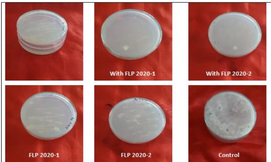
Fig 2: In vitro antagonistic potential of Fluorescent Pseudomonads isolates against Sclerotinia sclerotiorum of brinjal under Inverted plate technique