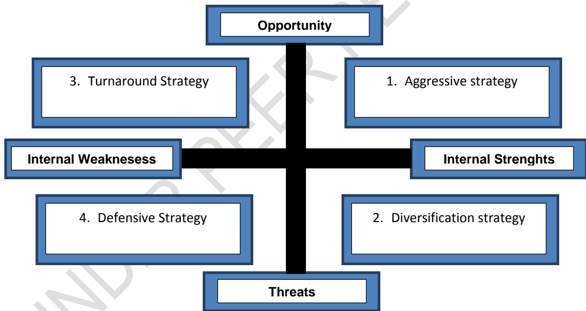
Fig 2. Strategy of Information System Implementation

improvement of facilities and infrastructure supporting facilities for the implementation of the main tasks and functions of Minarti, (2011: 295) infrastructure facilities must be adapted to the needs of the organization, both in terms of type, specification, amount, time, and place and price as well as sources that can be accounted for which are not must always be the same in every agency or company because it is in accordance with the needs of each sector of the organization/company. In implementing a good personnel management information system, it is necessary to communicate data and information for each work unit in BKPSDMD to be integrated using information network technology systems. standard telecommunications system. Integrated service digital network (ISDN) and Remote LAN Access are very popular tools used by employees (DeMarco, 1995)