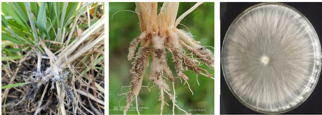
Fig: Field symptoms of foot rot disease of wheat (A) White mycelium growth on foot region of wheat (B) Sclerotia on collar region of stem (C) Pure culture of Sclerotium rolfsii