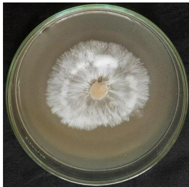
Bensulfuron methyl + Metsulfuron methyl