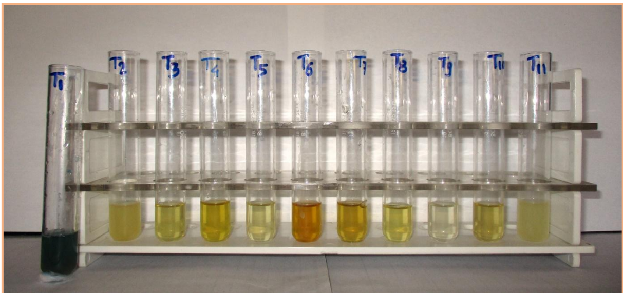
Plates 1: Siderophore production potential of selected microbial isolates on qualitative and quantitative basis.