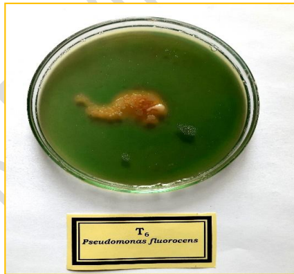
T 5 Pseudomonas fluorescens