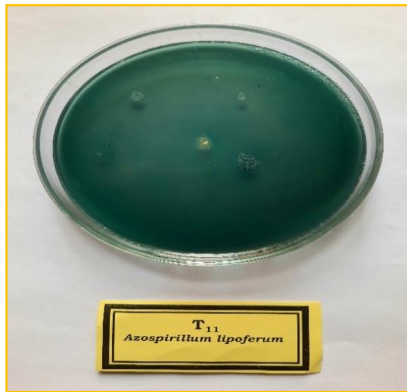
T 11 Azospirillum lipoferum