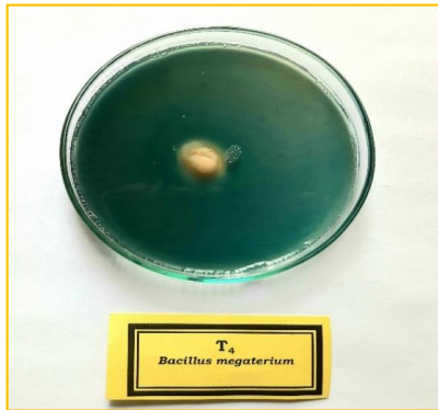
T 3 Bacillus megaterium