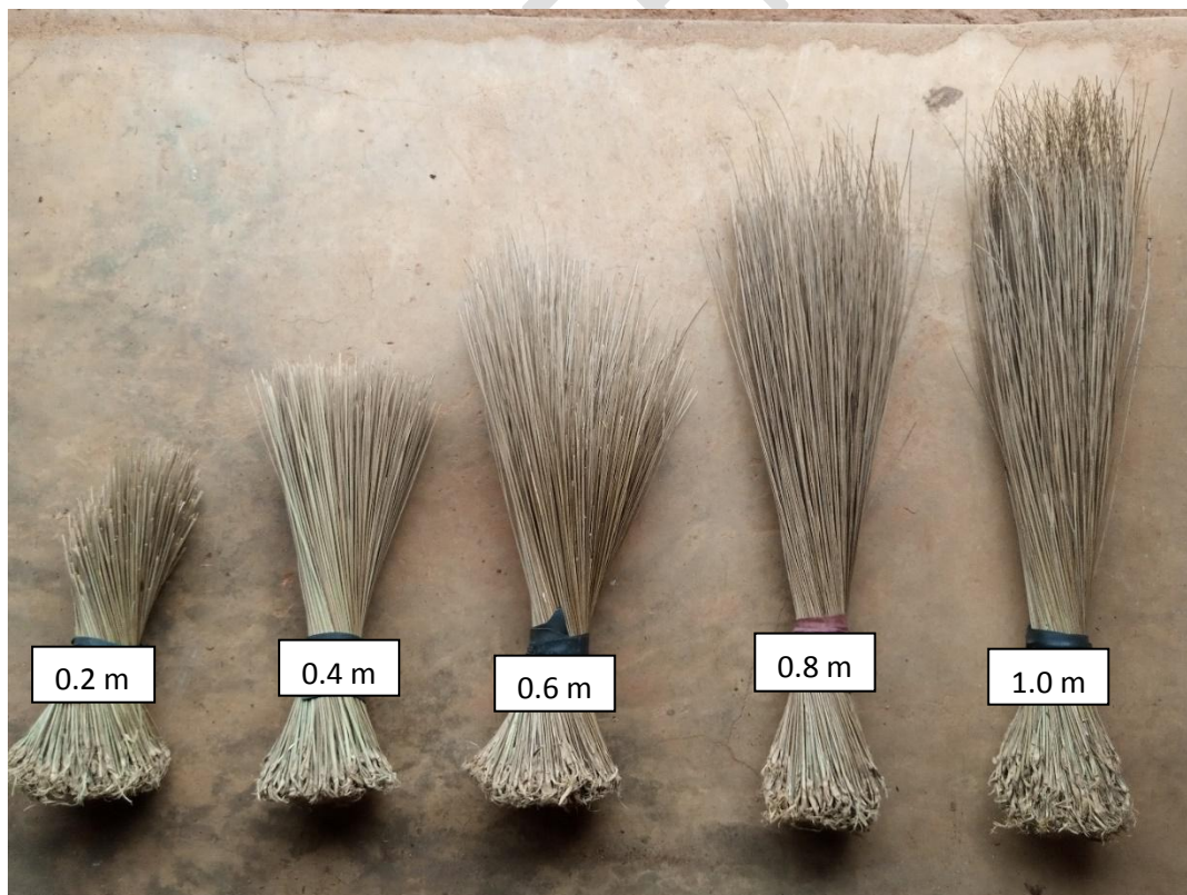
Fig. 3. Oil palm broom length variations used for the output efficiency optimization

The work took place at various locations with different ground surface terrain. Swept surface types used for the experiment are paved concrete floor, an unpaved sandy compound and tiled floor. Each floor type with a definite floor area was used for each set of experiment. Selected areas include Agbebi IV Mechanical Engineering 197.25 \text{ m}^2 sandy