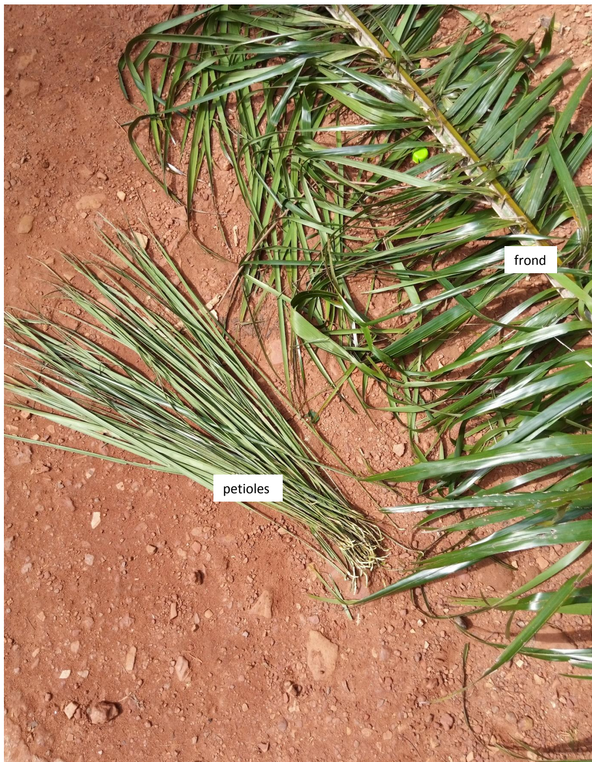
Fig. 2. Extracted palm frond leaf petioles for making broom

The production of oil palm brooms has remained largely subsistence and an itinerant village activity, probably because of the bush location of the raw materials and the inherent neglect