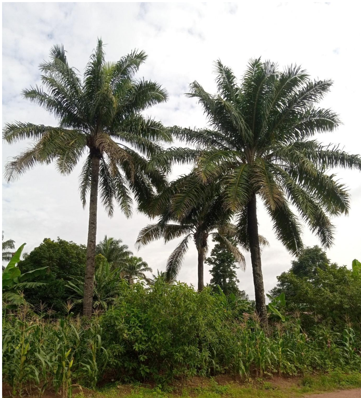
Fig. 1. Palm tree thriving in a farmland in Nsukka, Nigeria