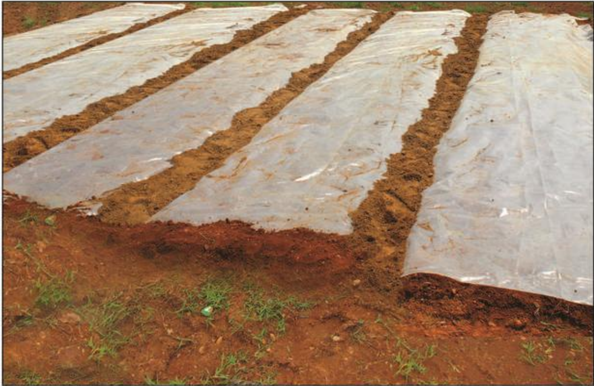
Soil solarization plots