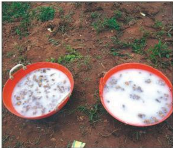
Rhizome treatment with streptomycin