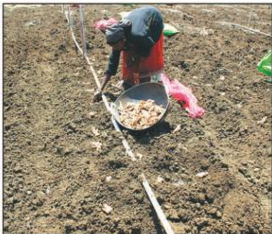
Planting of Rhizomes