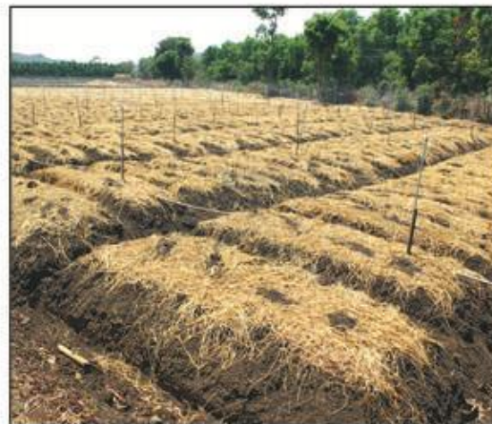
Overall view of field