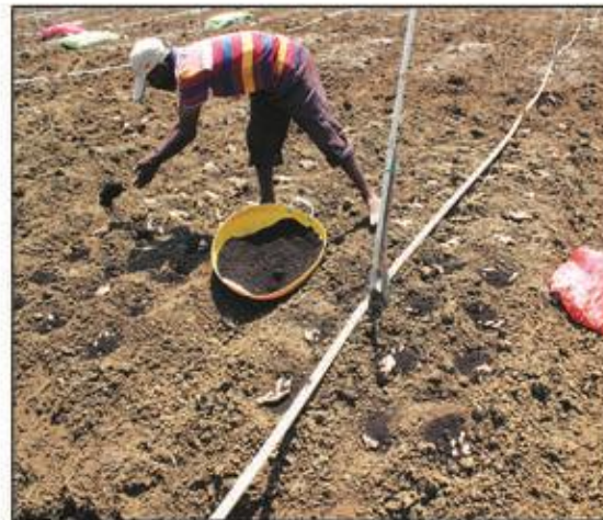
Application of neem cake along with FYM