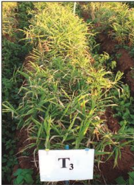
T3 = Soil solarization + Rhizome treatment with streptomycin @ 0.5 g + COC @ 3.0 g/l of water + soil application of Pseudomonas fluorescens @ 10 kg along with 25t FYM/ha