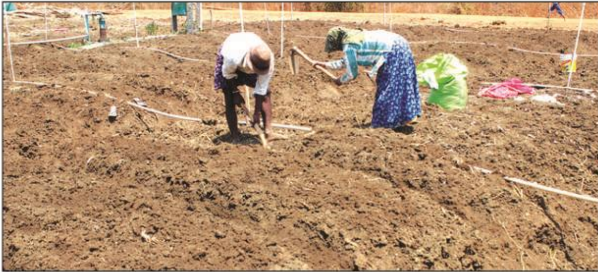
Preparation of raised beds