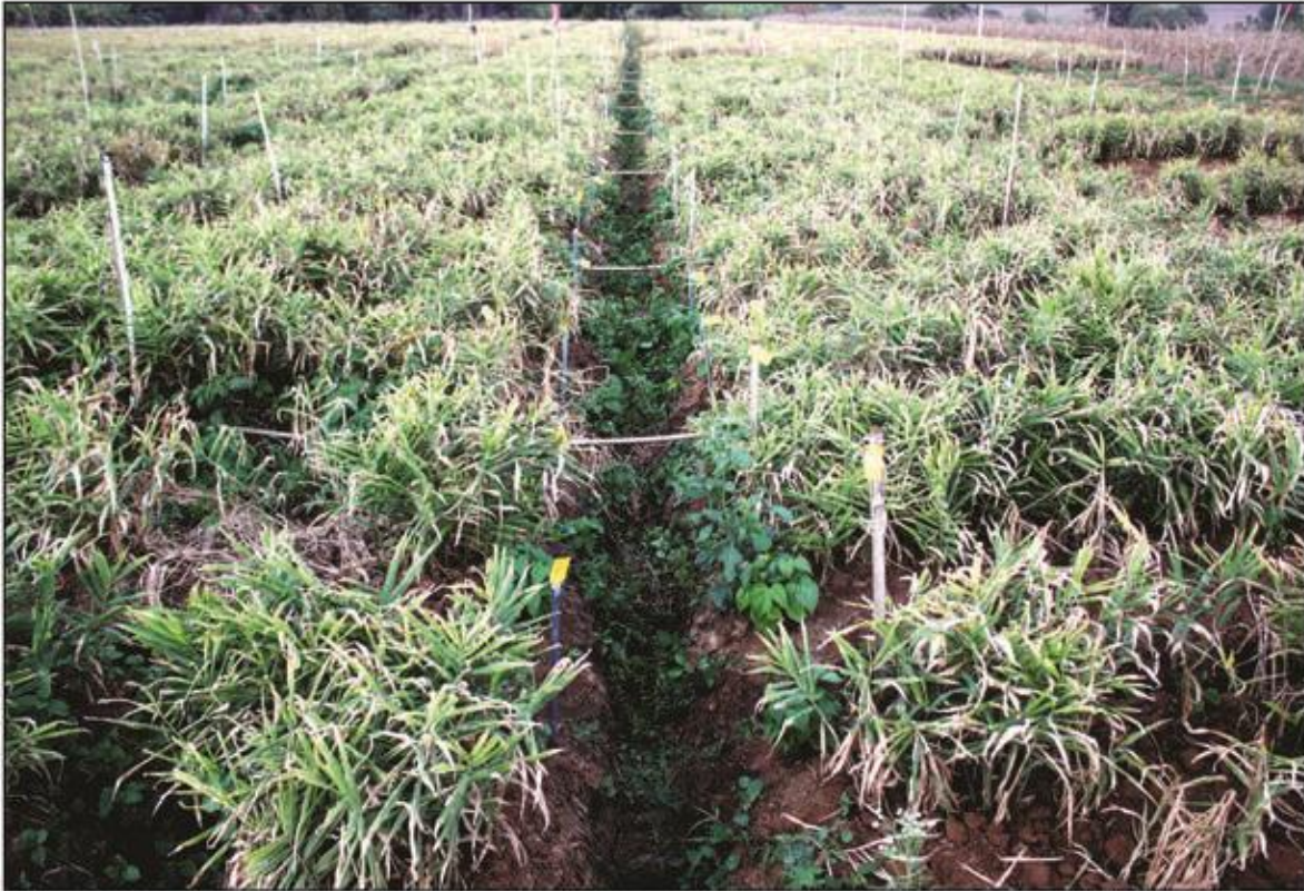
Overall view of field