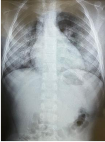
Figure 2: chest x ray of case number 3 showing diffuse alveolar