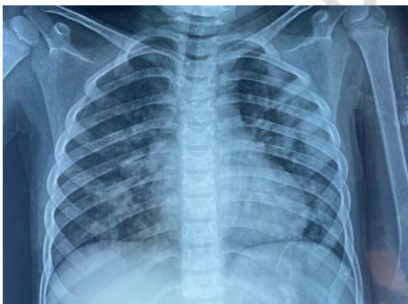
Figure 1: Chest x ray of case number 1 : diffuse alveolar opacity