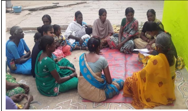
Pic 1. Group discussion