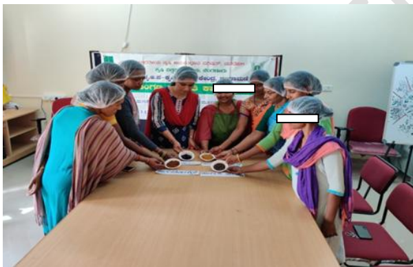
Pic 3. Method demonstration of value added products