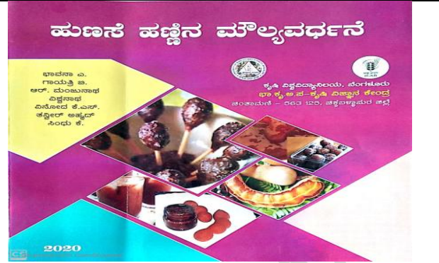
Pic 2. Development of folder