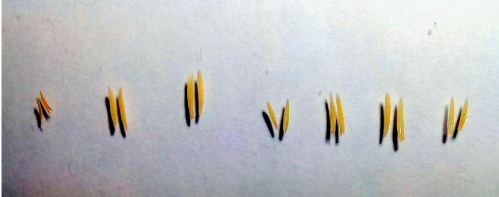
Figure 2: Anther size variation shown by triticale x wheat derivative lines.

Similar findings were obtained by many researchers (Song et al., 2018; Moskal et al., 2021; Tyson et al., 2019; Ren et al., 2017). The frequency distribution graphs (Figure 1) represent frequency of derivative lines according to anther size while figure 2 represents the variation of anther size shown by derivative lines. Chowdhary et al. (1994) and Singh et al. (2007) were suggested that the selection for long anthers may be effective in promoting natural cross pollination. The floral characters which enable sufficient cross fertilization like more open flowering habit, duration of flower opening, improved anther size in the male parent and stigma receptivity in the female parent more crucial for successful development of hybrids. Komaki and Tsunewaki (1981) find the significant association of anther size and it was suggested that the selection for high anther size promote outcrossing may result in the genotypes with more open pollination ability and these may be utilized as male parents to improve yielding ability. Singh et al., (2003) finds positive and significant correlation between yield and anther size. As the conclusion of all the reviews and study these derivative lines may be used as donor parents for provision of sufficient pollen availability in a hybridization programme.