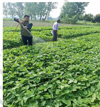
Fig. 1. Foliar spray of various nutrients

The Relative Humidity (RH) observed during crop season varied from 98.0% - 100% at 7 AM whereas, at 2 PM it ranged between 73.7% - 94.7%. The total amount of rainfall (675.63 mm) was received during the crop season (August- November 2021). There were ten treatments and they replicated thrice. Under replications, the treatments were allocated randomly. RDF “20 kg/ha N, 20 kg/ha P 2 O 5 , 20 kg/ha K 2 O” is applied as basal dose in all the treatments “except in Absolute control (T 1 )”. According to experimental treatments in each plot, the appropriate amount of foliar nutrients/chemicals and water was measured and then prepared a uniform solution and same solution was uniformly sprayed using conical-shaped nozzles with knapsack sprayer. As per treatments, first foliar administration (Fig 1) of nutrients was applied at 33 DAS i.e. , at pre flowering stage and again it was applied at pod initiation stage of plant, which was coincided at 53 DAS of crop under study. Collected data at various growth stages and upon harvest were analysed statistically in accordance with Gomez and Gomez's recommendations (1984). The "F" test's significance threshold was set at p=0.05 .