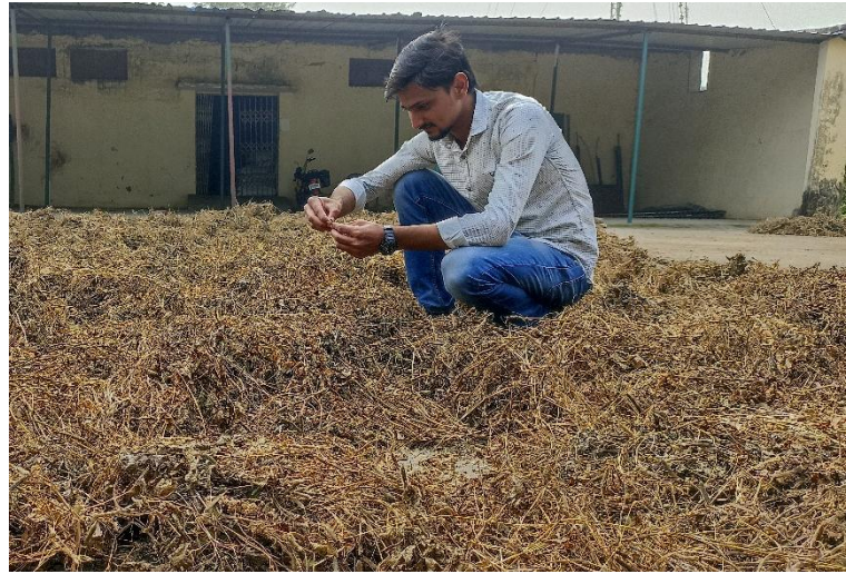
Fig. 2. Counting of number of seed per pod

Foliar spray of different chemicals at two critical growth stages, first at 33 DAS (Pre-flowering stage) and second at 53 DAS (Pod-initiation stage) increased seed number pod -1 significantly in “NPK (19-19-19) @ 2% Spray (T 4 )” i.e. , 5.99 as compared to all other treatments applied besides that it was at par with following treatments i.e. , Urea @ 2% Spray (T 5 ), DAP @ 2% Spray (T 6 ) and Potassium Nitrate @ 2% Spray (T 8 ) and it is revealed by the data tabulated in Table 2. Lowest seed number pod -1 were noted down in Absolute control (T 1 ) i.e. , 4.01 after harvest (Fig.2).