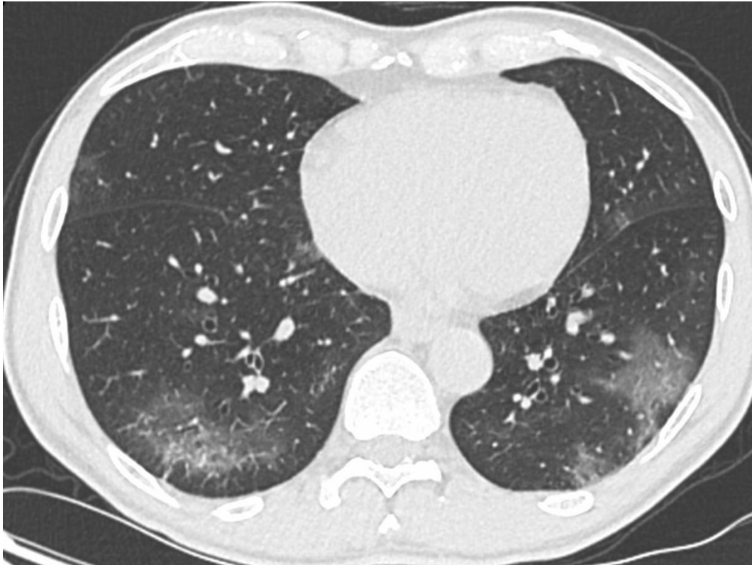
Figure 1: Chest CT scan without injection in axial sections: bilateral ground-glass areas (arrows)