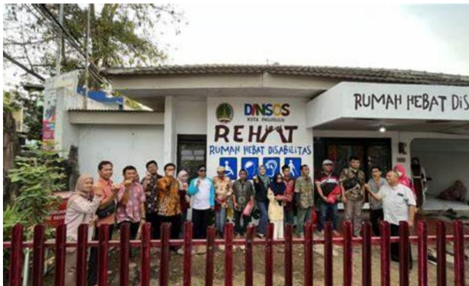
Fig 2. Great Disability House