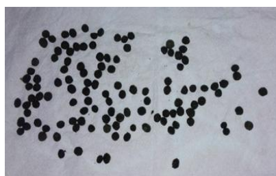
Figure 1- The prepared smaller pills were dried in the sunlight

procedure using flowing water. The external layers of the Aloe vera leaves were removed, and the internal gel portion was gently mashed into a paste, with 20.0g of this paste being weighed for further analysis. Centella asiatica leaves were subjected to grinding without the addition of water, and the resulting material was filtered using a clean cloth. Subsequently, 20.0 ml of the extract was quantified using a graduated cylinder. Pure and purified Strychnospotatorum seeds were gathered, and ground to a fine consistency, and a quantity of 20.0 g of the resultant powder was measured. These three measured samples were then combined and processed into diminutive pellets, as illustrated in Figure 1. The pellets underwent a gradual drying process under partial sunlight conditions.