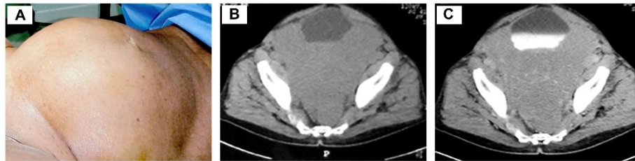
Figure 1. Panel A: clinical picture of the patient with giant prostate cancer showing lower abdominal swelling caused by the tumour

whole body bone scan which did not show evidence of bony metastases. Since the mass was anatomically very large, surgical removal or local radiotherapy was not attempted. The patient was treated by total androgen blockade (bilateral orchiectomy + bicalutamide). The patient has been doing well on regular follow up for the last 3 yrs with a reduction in the size of primary tumour diagnosed by ultrasound scan and PSA levels which reached a nadir level of 65 ng/ml.