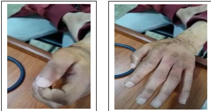
Fig 6: Functional status at 2 months