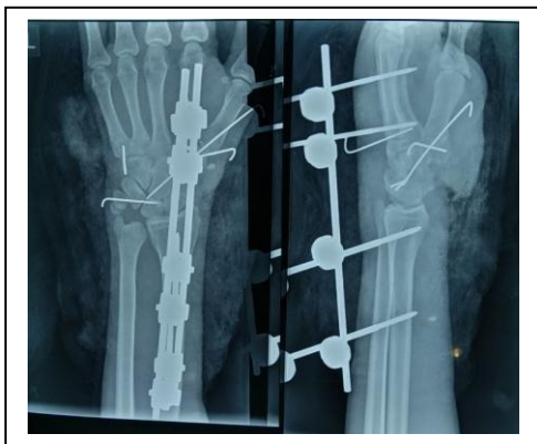
Fig 4: Post op x ray showing temporary fixation of 1 st CMC joint with k wires and external fixator.

Second look surgery was done with wound debridement and closure after 72 hours and daily dressing of wound were done. Antibiotics were continued for 10 days and external fixator was removed on 10 th post-operative day. Short arm splint was applied after removal of the external fixator. Passive range of motion were done by the physiotherapy team along with electrical stimulation of tissues for rapid healing. High protein diet were given to the patient for quick wound healing. Active range of motion were started at 4 weeks of surgery with intermittent hand splints.