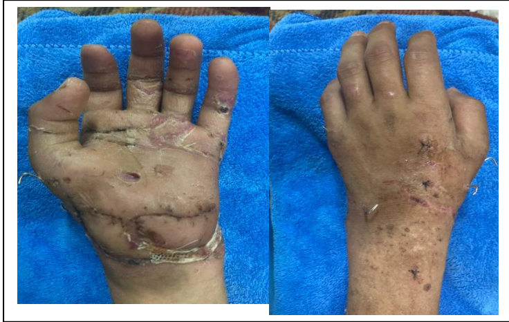
Fig 5: Wound status at 4 weeks