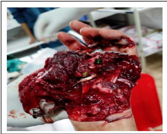
Fig 1. Shows extensive de gloving injury involving multiple flexor tendons, bones, nerves and vessels with high degree of contamination.

The foreign materials/debris were removed from the skin and soft tissues while washing. Radical debridement was done removing all the devitalized tissues and contaminations. Flexor tendons were exposed and tagged with sutures. Fractures of the bone were cleaned of debris and fixed with k wire. Ulnar artery was completely transected and was repaired along with the median nerve .With multiple carpal bone fractures and tendon injuries, a decision of applying external fixator was implemented, in order to protect the soft tissues, bones and tendons.