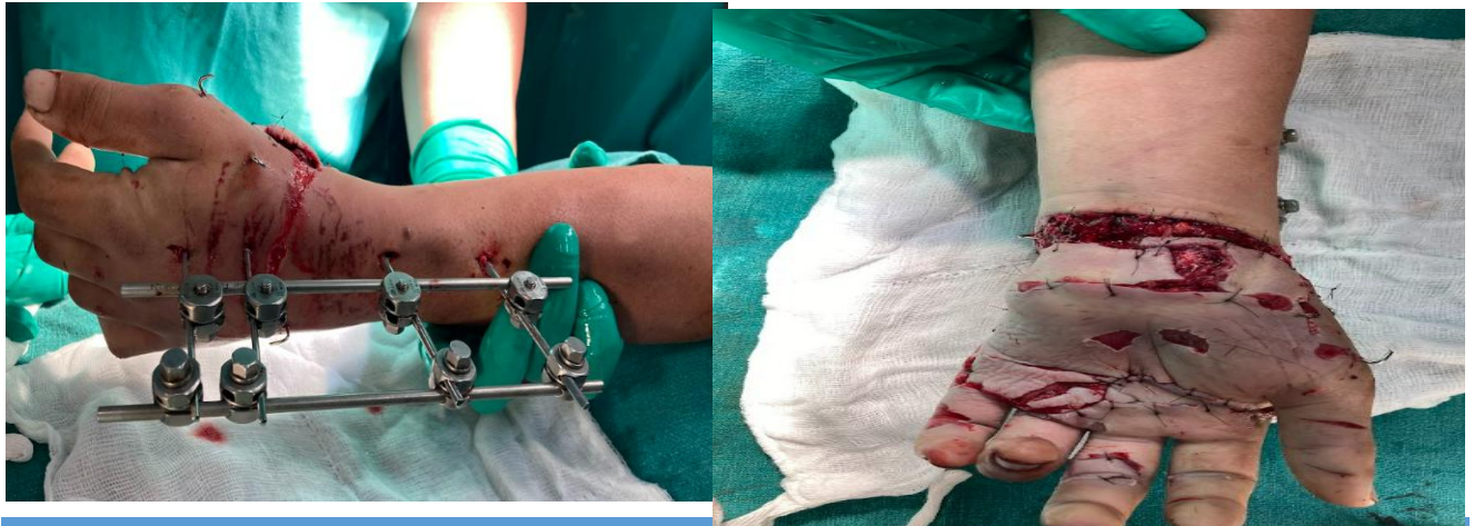
Fig 3: Immediate post-operative image showing loosely tagged skin sutures with external fixator

Fig 2: X rays shows the fracture of trapezium bone with subluxation of 1 st carpometacarpal joint of left hand.