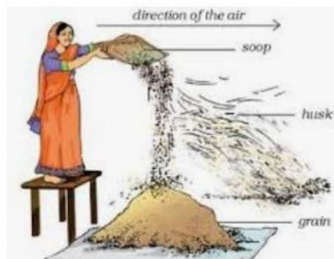
Figure 1: Traditional Means of Winnowing

“A grain winnower is a device used to separate grains from chaff by means of a wind or current of air. Threshing operations leave all kinds of trash mixed with the grain; they comprise both vegetable (e.g. foreign seeds or kernels, chaff, stalk, empty grains etc.) and mineral materials (e.g. earth, stones, sand, metal particles etc.) and can adversely affect subsequent storage and processing conditions. The cleaning operation aims at removing as much trash as possible from the threshed grains. Traditional cleaning method is winnowing, which uses the wind to remove light elements from the grain” [1].