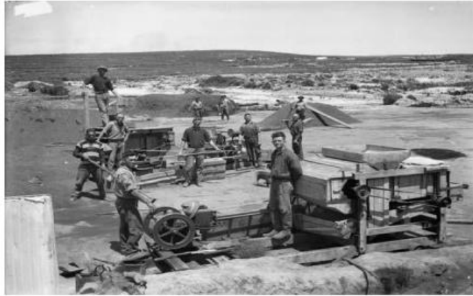
Figure 2: Ancient Winnowing Machine [Raid and Gray, 1902]

“Winnowing is the natural removal of fine material from coarser sediment by wind or flowing water, analogous to the agricultural separation of wheat from chaff. Wind winnowing is an agricultural method developed by ancient cultures for separating grain from chaff” [2]. “Wind winnowing is used to remove weevils or other pests from stored grain. It involves throwing the mixture (grain, seeds, husks, straw and chaff) into the air so that the wind blows away the light chaff” [4].