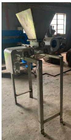
Fig 3: Picture of the Sorghum Winnowing Machine