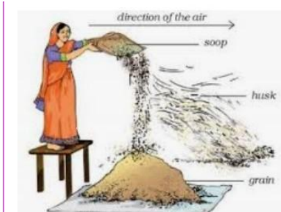
Figure 1: Traditional Means of Winnowing