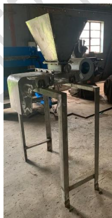
Fig 3: Picture of the Sorghum Wining Machine

Performance Evaluation was carried out to workability under conditions, so as to conditions or that may affect the the machine. This was ascertain whether or not performs the intended designed. This was also as to establish the rate which the task was [10,11].