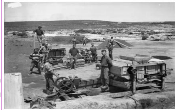
Figure 2: Ancient Winnowing Machine

Winnowing is the natural removal of fine material from coarser sediment by wind or flowing water, analogous to the agricultural separation of wheat from chaff. Wind winnowing is an agricultural method developed by ancient cultures for separating grain from chaff [2]. Wind winnowing is used to remove weevils or other pests from stored grain. It involves throwing the mixture (grain, seeds, husks, straw and chaff) into the air so that the wind blows away the light chaff [4].