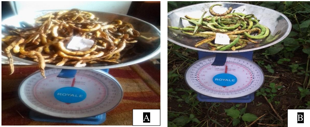
Plate 2: Taking weight of the dry (A) and fresh (B) pods of cowpea using a numerical weighing balance

The total number of fresh cowpea pods per plot was weighed at harvest and then sun dried for 2 weeks. The dry pods weights were determined by a numerical weighing scale which was manufactured by Archimedes.