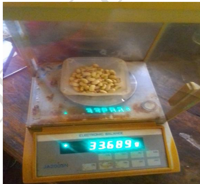
Plate 3: Taking the weight of seeds with a digital weighing balance

At harvest, (above 80 DAP), 100 fresh seeds were weighed and later dried in the sun for 2 weeks for weight assessment using a digital weighing balance which was manufactured by Richard Loshbough and Edward Pryor.