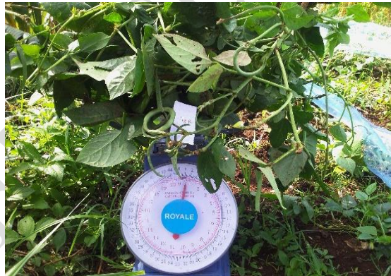
Plate1: Measurement of plant biomass of cowpea plants using a numerical weighing balance

The numbers of leaves data were collected on five tagged plants per plot at weekly intervals from 21 to 49 days after planting. Also, the number of branches was collected by counting all the branches on the five tagged cowpea plants from day 21 after planting at weekly intervals. At 80 DAP, five cowpea plants were uprooted with pods and flowers intact on each plot and weighed using a numerical weighing balance.