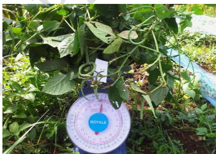
Plate1: Measurement of plant biomass of cowpea plants using a numerical weighing balance

At 80 DAP, five cowpea plants were uprooted with pods and flowers intact on each plot and weighed using a numerical weighing balance.