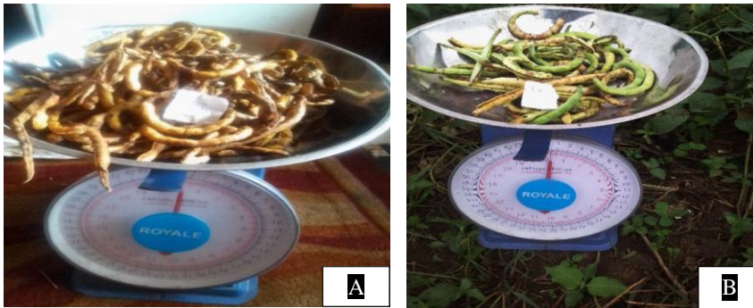
Plate2: Taking weight of the dry (A) and fresh (B) pods of cowpea using a numerical weighing balance

The total number of fresh cowpea pods per plot was weighed at harvest and then dried by sun for 2 weeks and dry pods weights were determined by a numerical weighing scale which was manufactured by Archimedes.