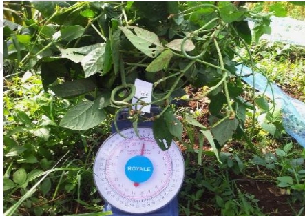
Fig 1. Plate1: Measurement of plant biomass of cowpea plants using a numerical weighing balance

At 80 DAP, five cowpea plants were uprooted with pods and flowers intact on each plot and weighed using a numerical weighing balance.