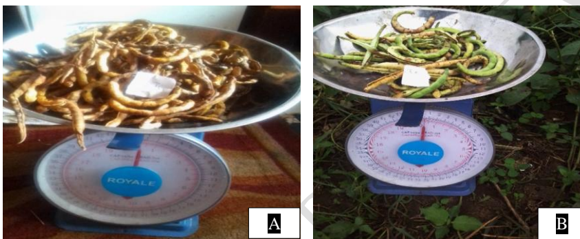
Fig 2. Plate2: Taking weight of the dry (A) and fresh (B) pods of cowpea using a numerical weighing balance

The total number of fresh cowpea pods per plot was weighed at harvest and then dried by sun dried for 2 weeks. The -and dry pods weights were determined by a numerical weighing scale which was manufactured by Archimedes.