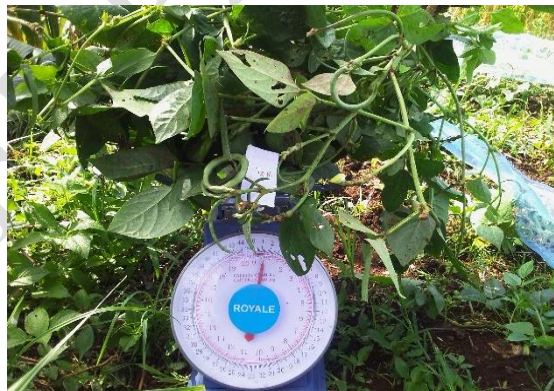
Plate1: Measurement of plant biomass of cowpea plants using a numerical weighing balance

At 80 DAP, five cowpea plants were uprooted with pods and flowers intact on each plot and weighed using a numerical weighing balance.