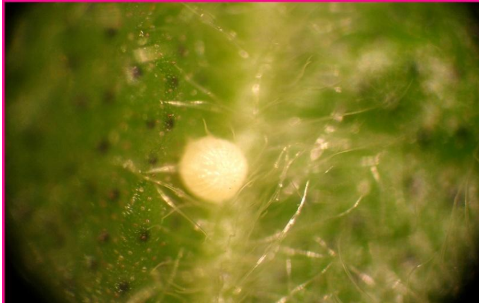
Plate 1: Helicoverpa armigera egg

The population collected from Mahaboobnagar , Raichur and Nagpur were reared on artificial diet (Plate 1 and 2) in the laboratory as per the procedure given by Kranthi (2005). Male and female pupae were separated. One pair per jar (♂ and ♀ pupae) was kept for adult emergence, mating and oviposition. The eggs obtained from single pair were reared to get first generation larvae. Third instar H.armigera larvae from (1 st generation) F 1 with an average weight of 30 mg ± 0.011 S.E. were treated separately with different concentrations of the test insecticides.