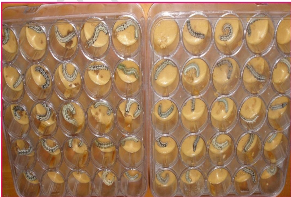
Plate 2: Helicoverpa armigera larvae on artificial diet