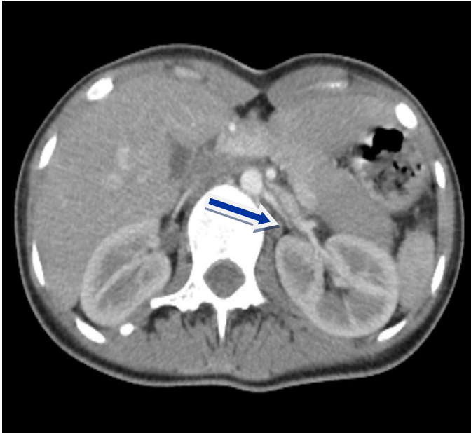
Figure 2: Abdominal CT scan after injection in axial section Reduction in the calibre of the interaortic mesenteric passage