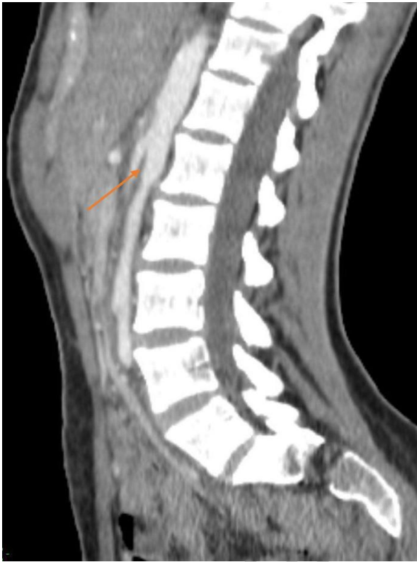
Figure 3: Sagittal section of abdominal CT scan with PDC injection showing pinching of the superior mesenteric aorta-arterial angle.