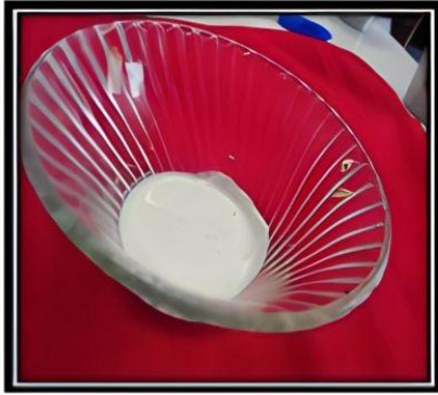
Fig.3.Latex of Euphorbia antiquorum