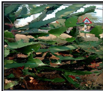
Fig.2. Euphorbia antiquorum