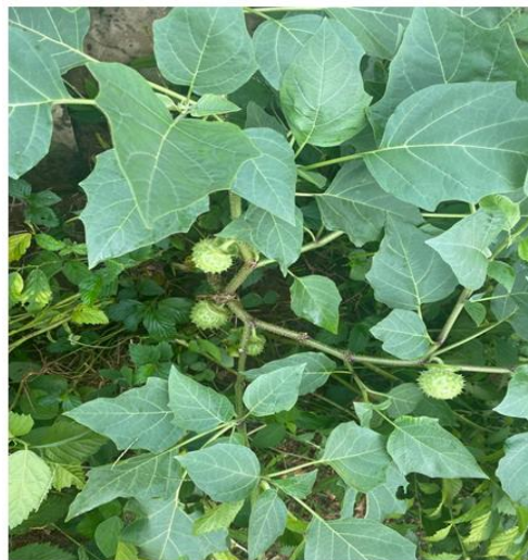
Plate 3. Datura metel (Thornapple, Jimson weed) with maturing fruits

scientific assessment of the neuro-behavioural fallouts of accidental/intentional ingestions of high doses of DM is sparse. The aim of this study therefore is to evaluate the neuro-behavioural toxicity potential of single high doses of DM seed/leaf extracts in mice.