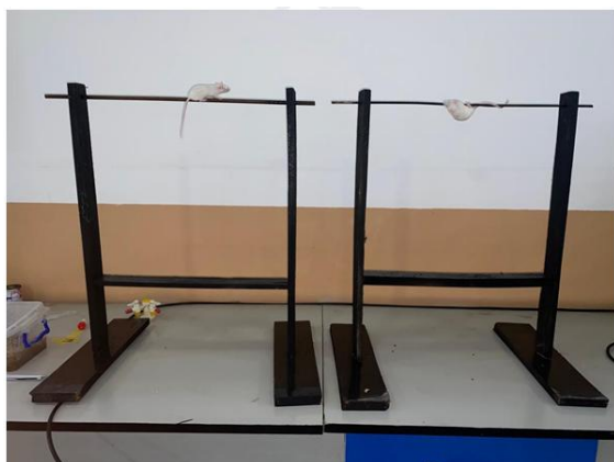
Plate 6. Two units of Beam (rod) walking test apparatuses with 2-mm and 4-mm iron rods

full return of the righting reflex in the experimental mice (Plate 4).