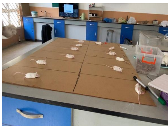
Plate 5. Experimental mice at different phases of hypnosis

sexes) were randomized into 7 experimental groups I – VII (n = 6) and were each individually introduced into the test chamber of the actophotometer for 10 minutes and a basal activity was recorded for each mouse. An experimental group was subsequently given oral treatment of distilled water 10 ml/kg, aqueous methanol TGL 1500 mg/kg, aqueous methanol MPS 1500 mg/kg, aqueous methanol DML 750 mg/kg, aqueous methanol DMS 750 mg/kg, aqueous tramadol 133 mg/kg, or aqueous diazepam 2 mg/kg. 1 hour following their respective treatments mice were each re-exposed to the test for 10 minutes and their activities were recorded by the device's digital counter. The counter was stopped at the end of each trial for tested mice and was re-set before the next trial. The basal and post-treatment activities for each mouse were compared and the percentage reduction or increase in activity was recorded in a way that each animal acted as its own control.