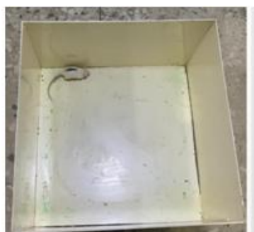
Day 1. Plain open field maze

allowed to freely explore the environment for 10 minutes - with only those which explored each of the plastic objects for a minimum of 20 seconds of the test period deemed to have met inclusion criteria for the main cognitive test. Subsequently,