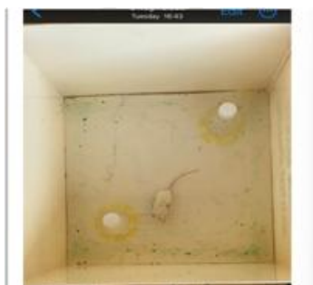
Day 2. Open field with similar objects