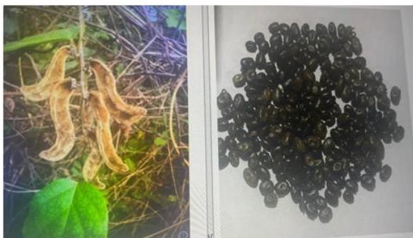
Plate 2. Mucuna pruriens dry pods and Mucuna pruriens dry seeds