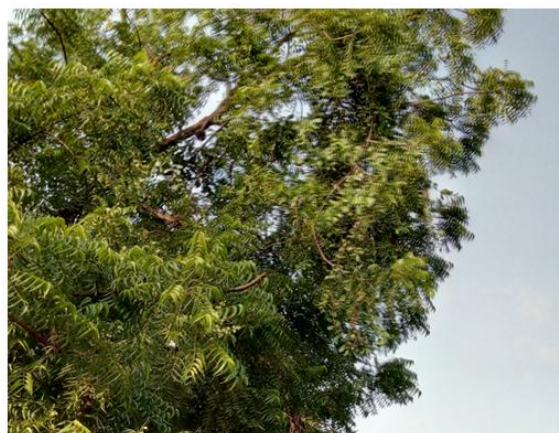
Plate 1. Tapinanthus globiferus parasitising Azadirachta indica (Neem) tree

Mucuna pruriens [Plate 2], with common names: velvet, devil's beans or cowhage, is a leguminous plant of the Fabaceae family comprising over 100 species [14,15]. The seed extracts of this medicinal plant have been credited with ethnomedicinal efficacy in male infertility, snake bites, nervous disorders, Parkinson's, and related neurodegenerative diseases [14-16].