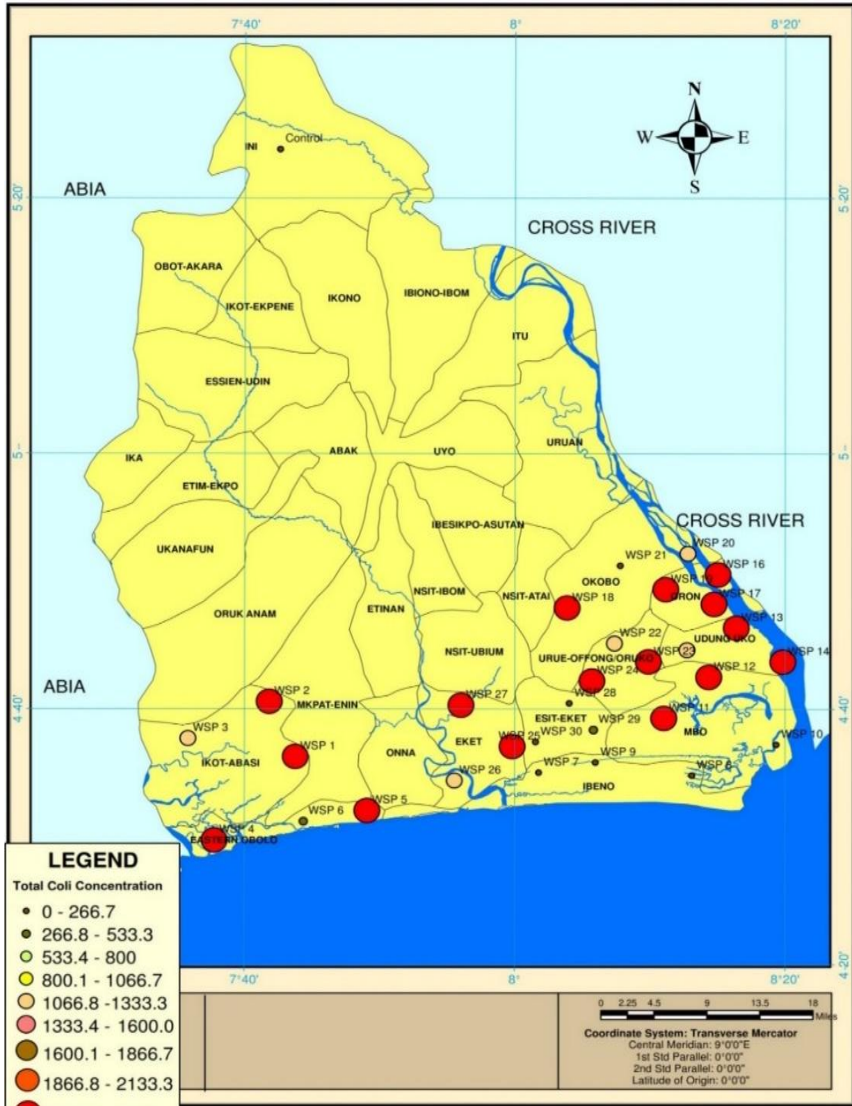
TOTAL COLIFORM CONCENTRATION MAP OF STUDY AREA