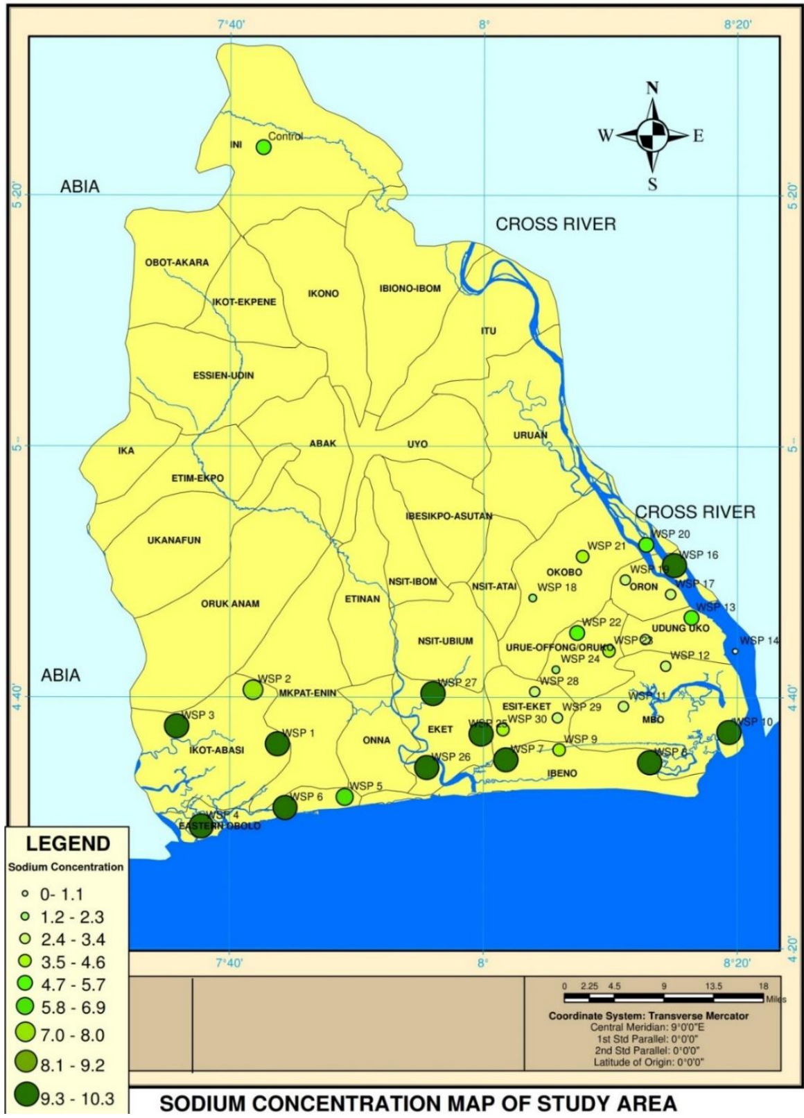
Figure 5: Sodium Concentration Distribution Map of Study Area