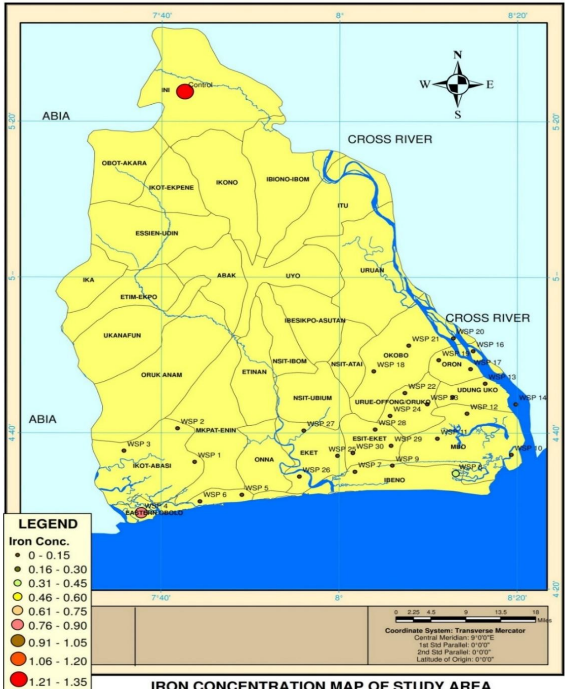
IRON CONCENTRATION MAP OF STUDY AREA