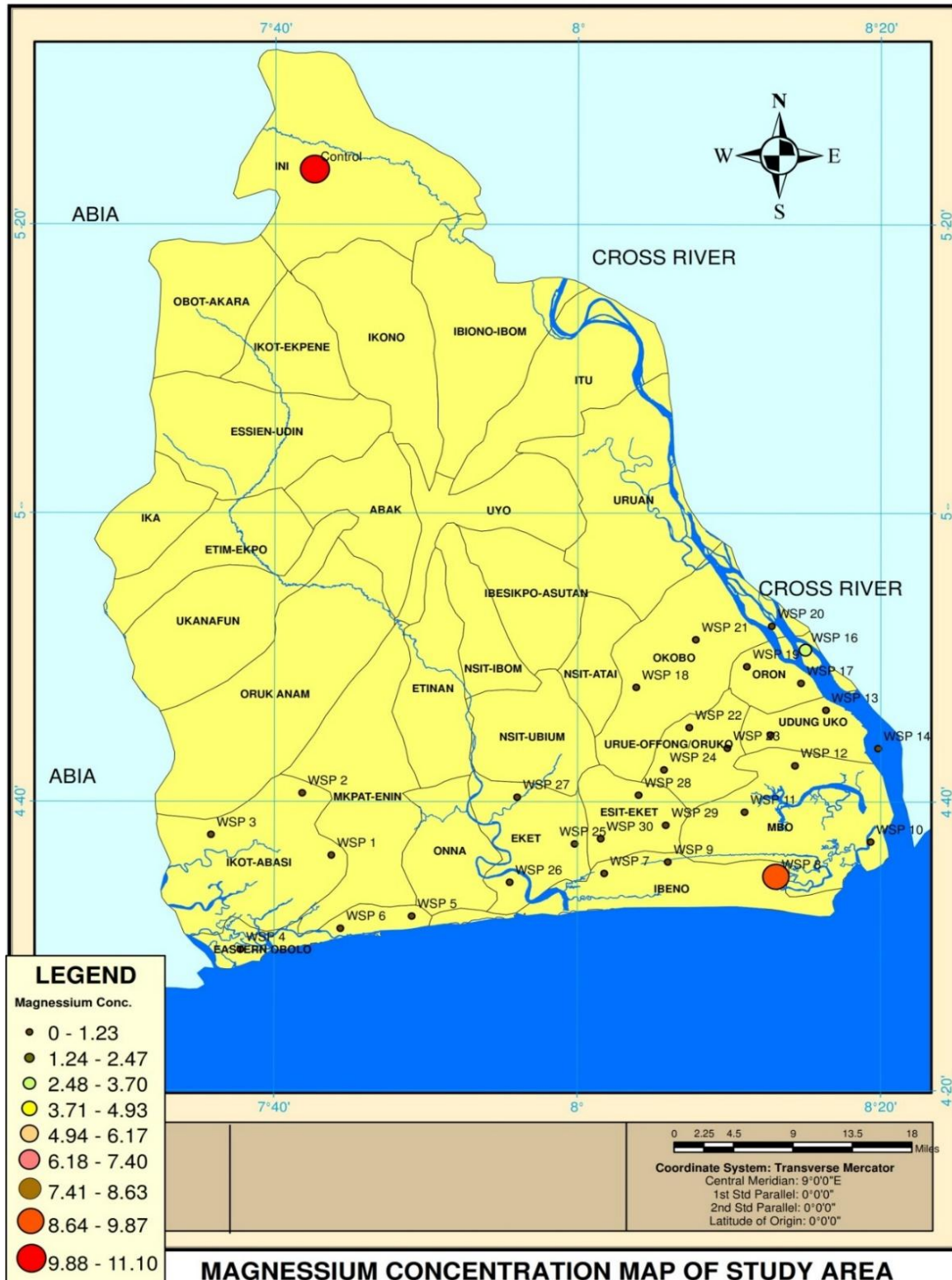
Figure 3: Magnesium Concentration Distribution Map of Study Area