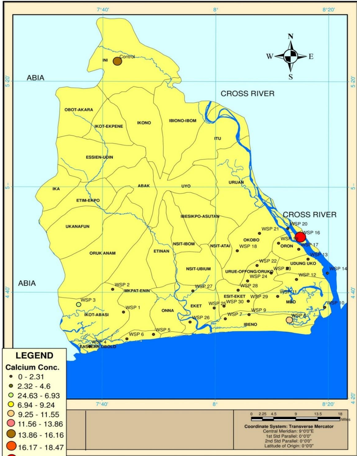
CALCIUM CONCENTRATION MAP OF STUDY AREA