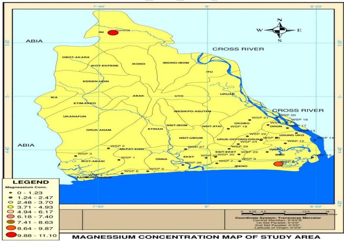
Figure 3: Magnesium Concentration Distribution Map of Study Area