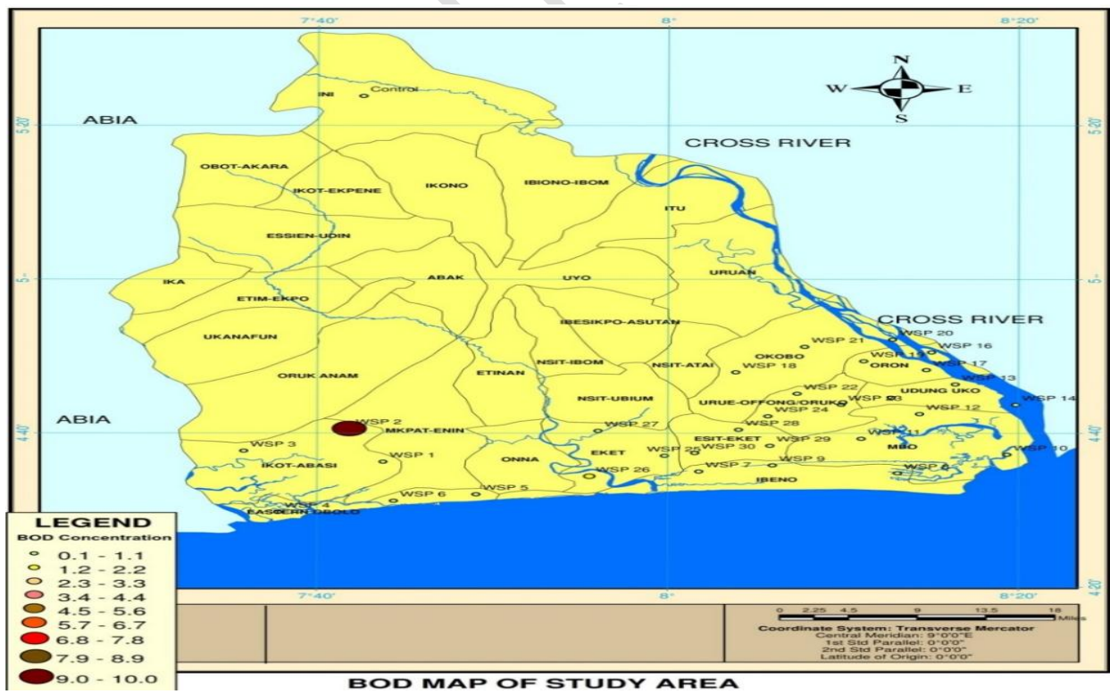
Figure 7: BOD Concentration Distribution Map of Study Area