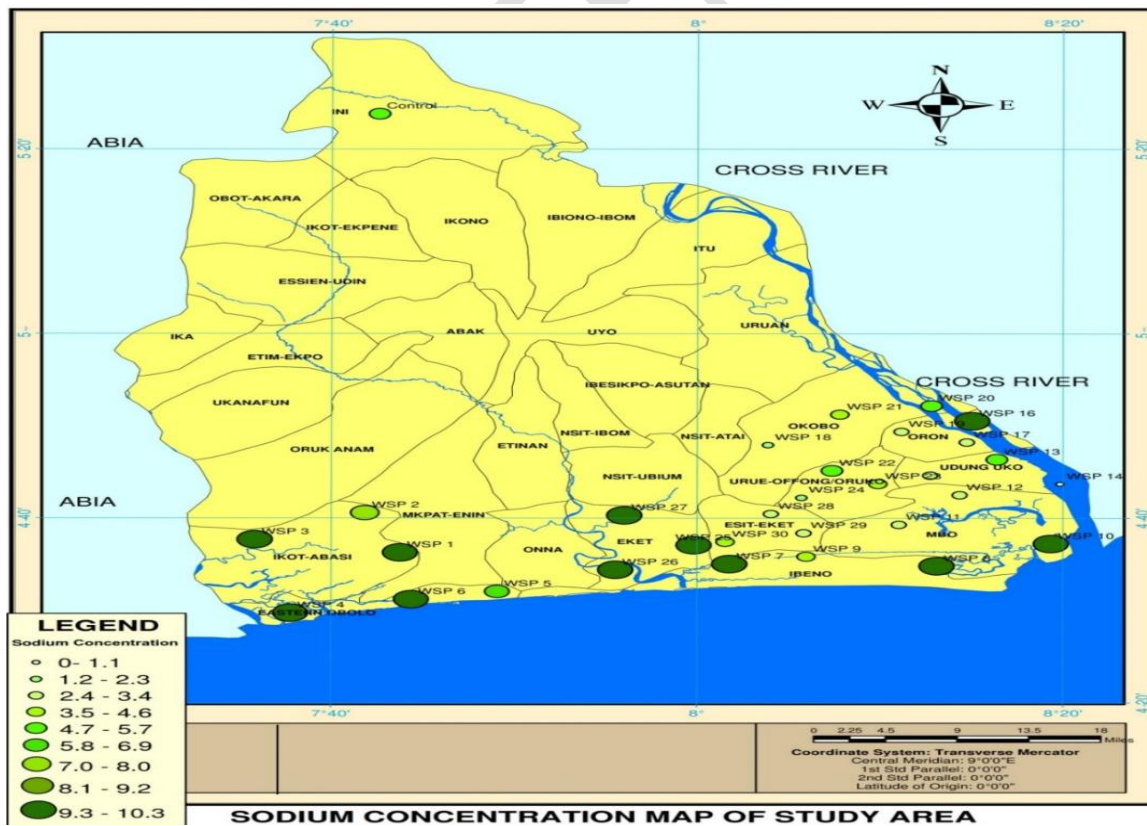
Figure 5: Sodium Concentration Distribution Map of Study Area