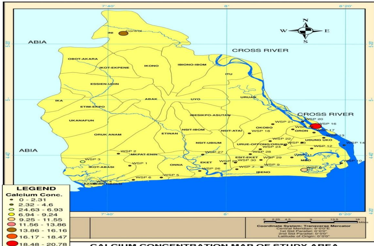
Figure 4: Calcium Concentration Distribution Map of Study Area