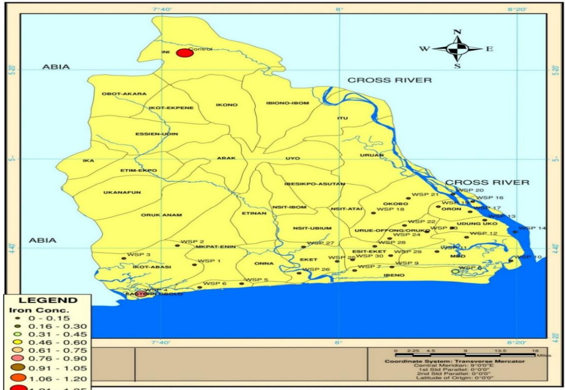
Figure 2: Iron Concentration Distribution Map of Study Area