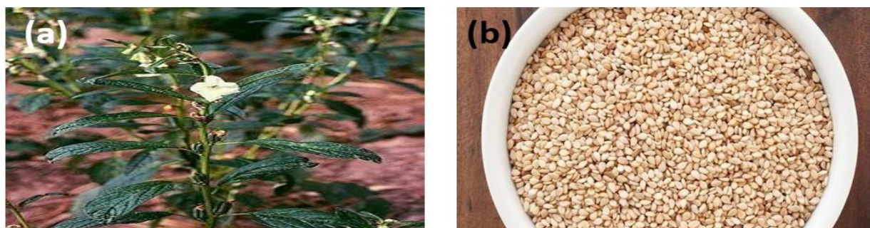
Pic 1. Sesame Indicum : Plant (a), Seeds (b)

thermal stability and polymeric properties such as glass transition, crystallization temperature and melting point were investigated.