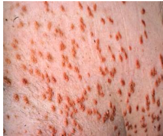
Fig 2. Xanthomas (Ladizinski et al., 2013)