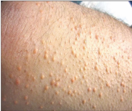
Fig 1. Dyslipidemia