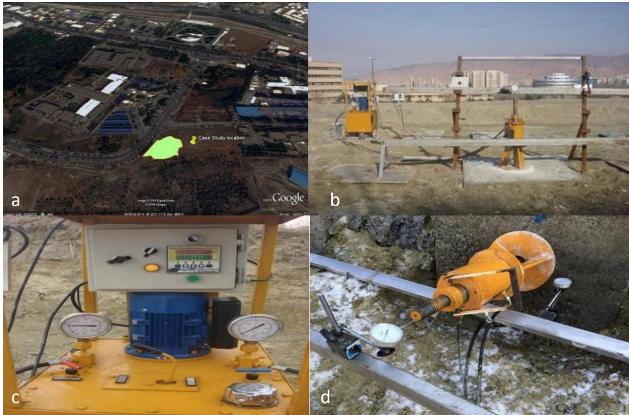
Figure 1. Aerial image of the study site along with the tension-compression jack and its peripherals. (a) areal images of the study site. (b) The jack system and its accessories installed at the study site. (c) Data logging and pressure calibration device. (d) The interface connecting the jack to the anchor and installation of measurement gauges. Axial displacement of the anchor and the concrete pad settlement.

32. Zhang, K.; Fortelle, A. Analysis and modeled design of one state-driven autonomous passing-through algorithm for driverless vehicles at intersections. In Proceedings of the 16th IEEE International Conference on Computational Science and Engineering, Sydney, Australia, 3–5 December 2015.