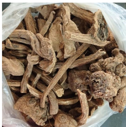
Figure 2: Dried root of Pushkaramoola ( Inula racemosa Hook.f.)

Flowering & Fruiting time : July-September.