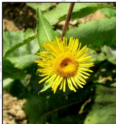
Figure 1: Plant Pushkaramoola ( Inula racemosa Hook.f.)

Erect herb, up to 1.8m tall, young parts densely hairy. Leaves elliptic-lanceolate or obovate, amplexicaul. Flowers in heads, yellow. Fruit achene.