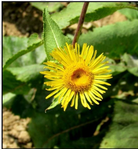
Figure 1: Plant Pushkaramoola ( Inula racemosa Hook.f.)

Erect herb, up to 1.8m tall, young parts densely hairy. Leaves elliptic-lanceolate or obovate, amplexicaul. Flowers in heads, yellow. Fruit achene.