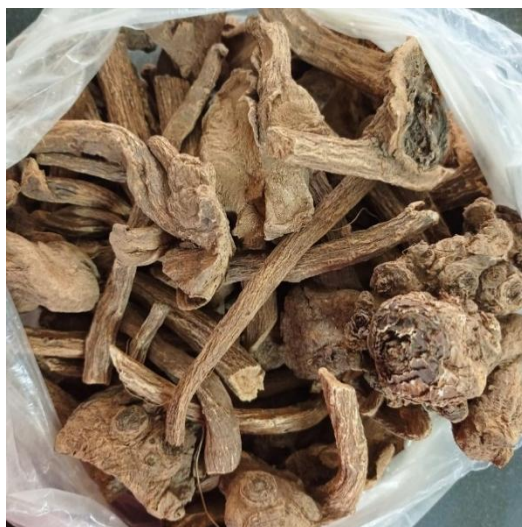
Figure 2: Dried root of Pushkaramoola ( Inula racemosa Hook.f.)

Flowering & Fruiting time : July-September.