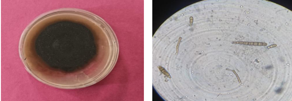
Plate.2: Pure Culture of Alternaria brassicicola and its spores

Effect of culture media on growth and sporulation of Alternaria brassicicola (Schwein.) Wiltshire.