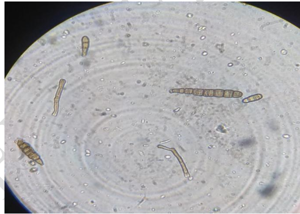
Plate.2: Pure Culture of Alternaria brassicicola and its spores

Effect of culture media on growth and sporulation of Alternaria brassicicola (Schwein.) Wiltshire.