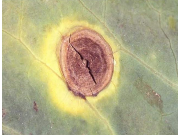
Plate 1: General view of field symptoms of leaf spot in cauliflower