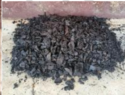
Fig 5: Biochar