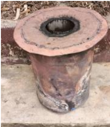
Fig 4: The Pilot Carbonization Kiln