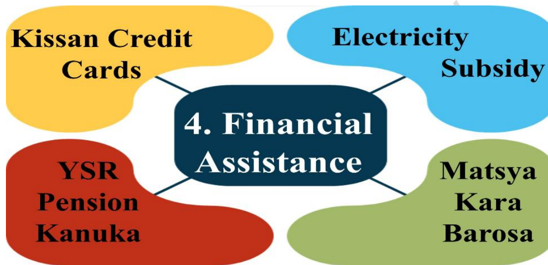
Fig.-2: Financial Interventions provided by Fisheries department of Andhra Pradesh