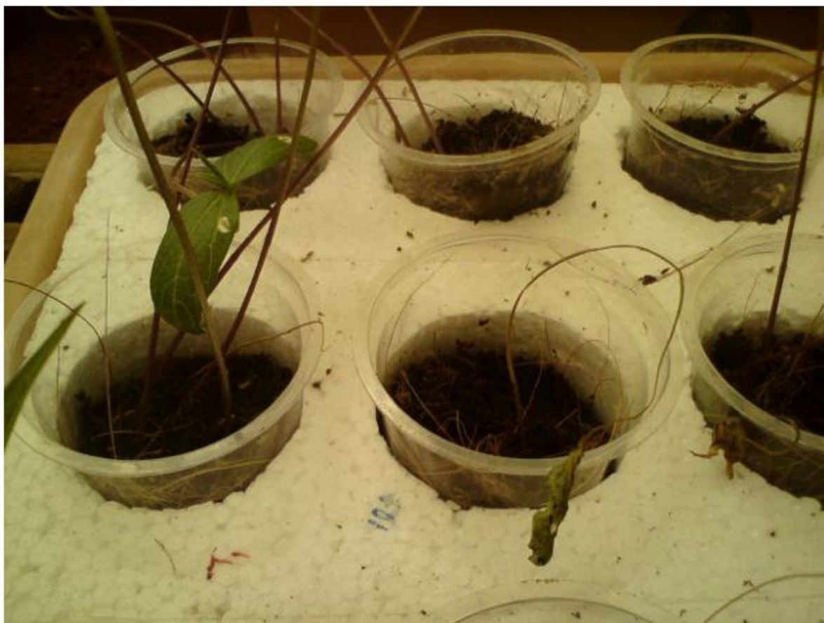
Fig.3. Response of the susceptible blackgram seedlings (RU-8-708) to salinity