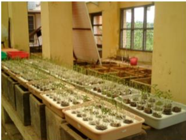
Fig.1. Overview of the blackgram seedlings on 6 DAS